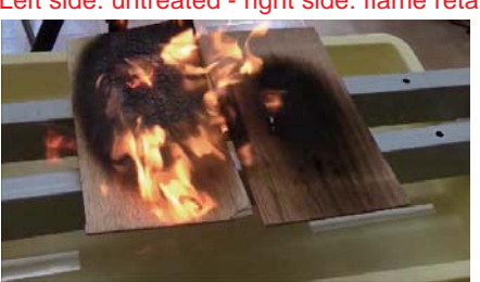
Left side: untreated - right side: flame retardant treatment

The plywood burns out suddenly. Flame retardant treated plywood only carbonizes.