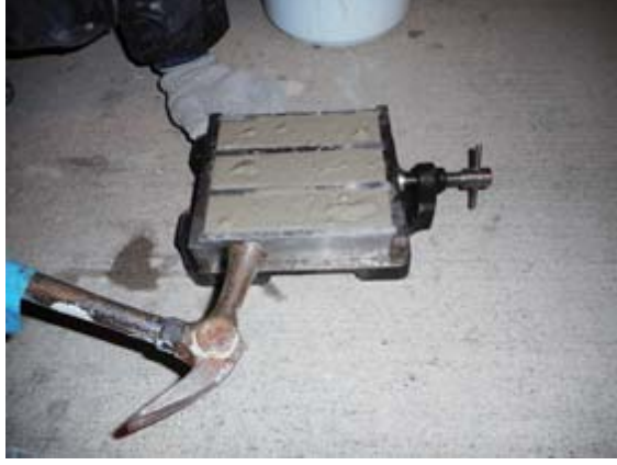
SKY-G1, SKY-CSP 60% (W / C) paste Specimen collection