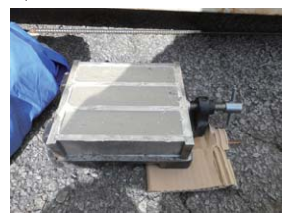
SKY-G1, SKY-CSP 60% (W/C) paste Specimen 1 day passed. Usually cement paste bleaches and precipitates, but bleaching water does not rise and it solidifies.

As a material contributing to longer building life, SKY-CSP (fine powder Blended furnace slag cement containing silica). Use for repairing water leakage and insufficient strength due to weakening of concrete Show. In injecting cement paste, W/C 30%, The cement particles settle down and form a fragile layer such as bleeding water and latency. In the HYDROFit method, SKY-CSP and SKY-G1 are kneaded with 60 to 80%.